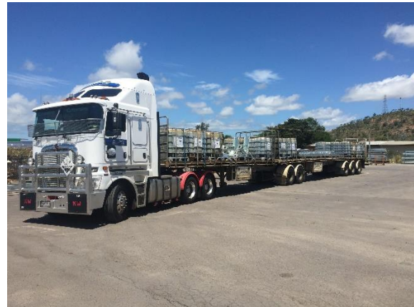
B Double Operations between CNS-TSV-MKY