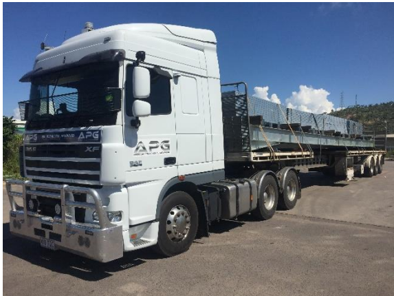
Oversize 18m Rafters for site delivery